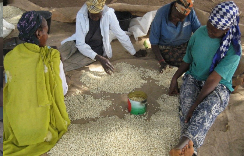
Figure 2 and 3: Seed drying machine purchased in the 1980s (left) and manual sorting of harvested commercial seed (right).

used by the Grains and Legumes Development Board (GLDB) is over 30 years old and frequently breaks down. This has resulted in less efficient and laborious activities such as manual seed cleaning and sun drying of seeds. Consequently, seed producers have intermittently raised issues regarding the quality of foundation seed which can clearly be attributed to the antiquated seed conditioning equipment.