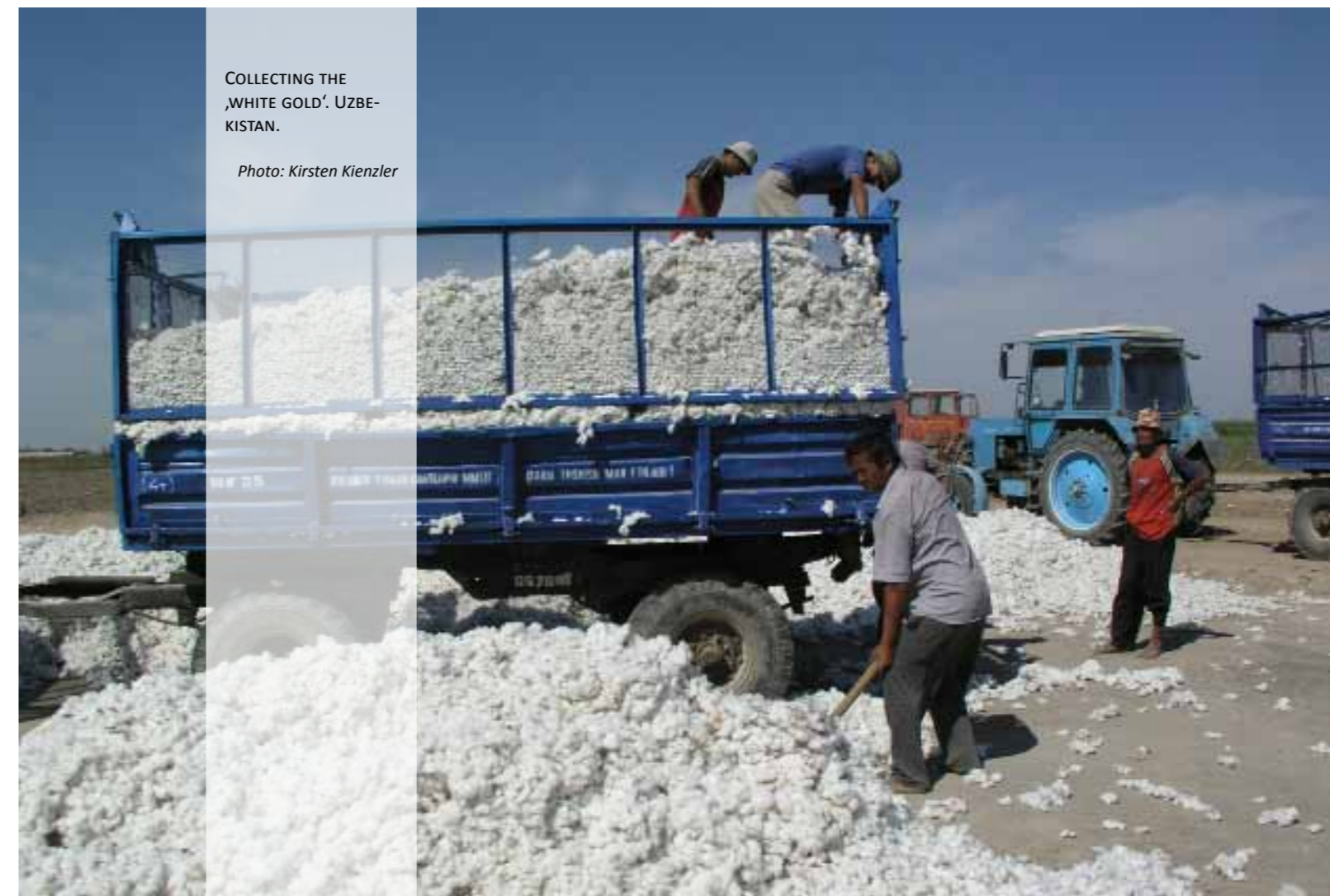
COLLECTING THE 'WHITE GOLD'. UZBEKISTAN.