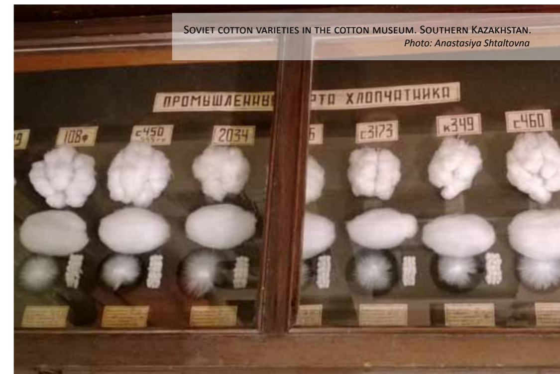
SOVIET COTTON VARIETIES IN THE COTTON MUSEUM. SOUTHERN KAZAKHSTAN.

Although less important in terms of total acreage, rice and cotton were significant crops in the south and cotton was Kazakhstan's third largest export to non-Soviet markets after mineral fertilisers and coal (ibid). Research on the historical genesis of cotton