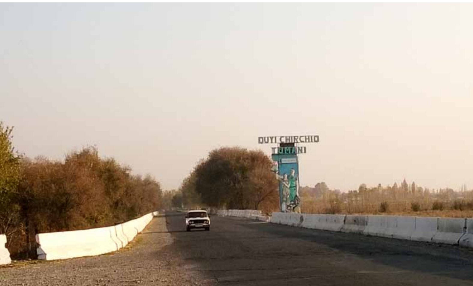
AN ENTRANCE TO THE VILLAGE WHERE COTTON IS GROWN. UZBEKISTAN.

ving the performance of the cotton sector in both countries emerge from the analysis: professionalisation of farmers should be encouraged; farmers associations that represent farmers' interests should replace state organisations; communication between farmers and the state should be improved; cotton monocultures should gradually be transitioned to diversified cropping systems; and on-site capacity for cotton processing should be supported. Building on these recommendations, the following sub-goals are tailored to the Uzbek case in particular: achieving minimum intervention of the state in farmers' transactions; increasing the farm-gate price for cotton; making the tax system simpler and more transparent for farmers; improving agricultural service provision; training agricultural producers to be entrepreneurs; facilitating contract-based relations between farmers and agricultural service organisations; improving channels for agricultural producers to share knowledge or establishing new ones; and creating conditions in which heterogeneous models of cotton growing can coexist.