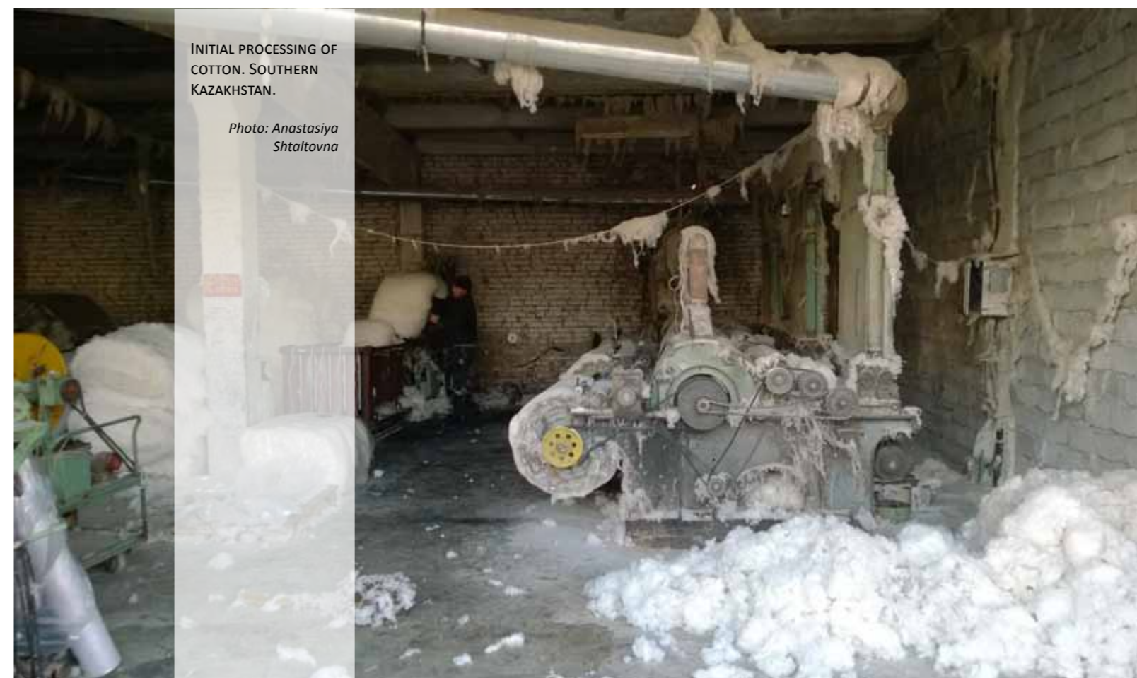
INITIAL PROCESSING OF COTTON. SOUTHERN KAZAKHSTAN.