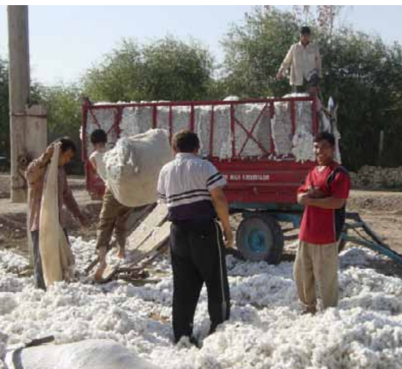
COLLECTING COTTON. UZBEKISTAN.

Based on this and other sections of the paper, Figure 2 summarises the similarities and differences between cotton growing systems in Kazakhstan and Uzbekistan.