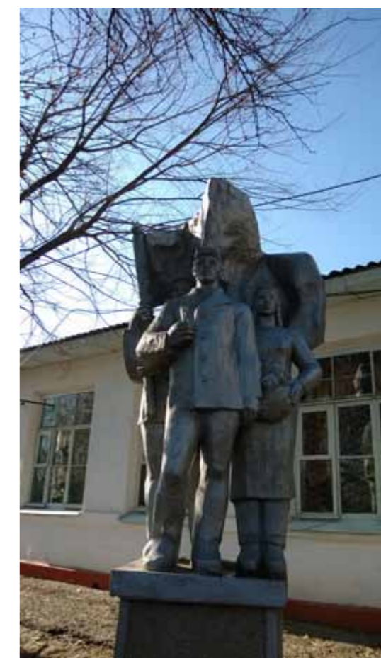
MUSEUM OF COTTON HISTORY. SOUTHERN KAZAKHSTAN.