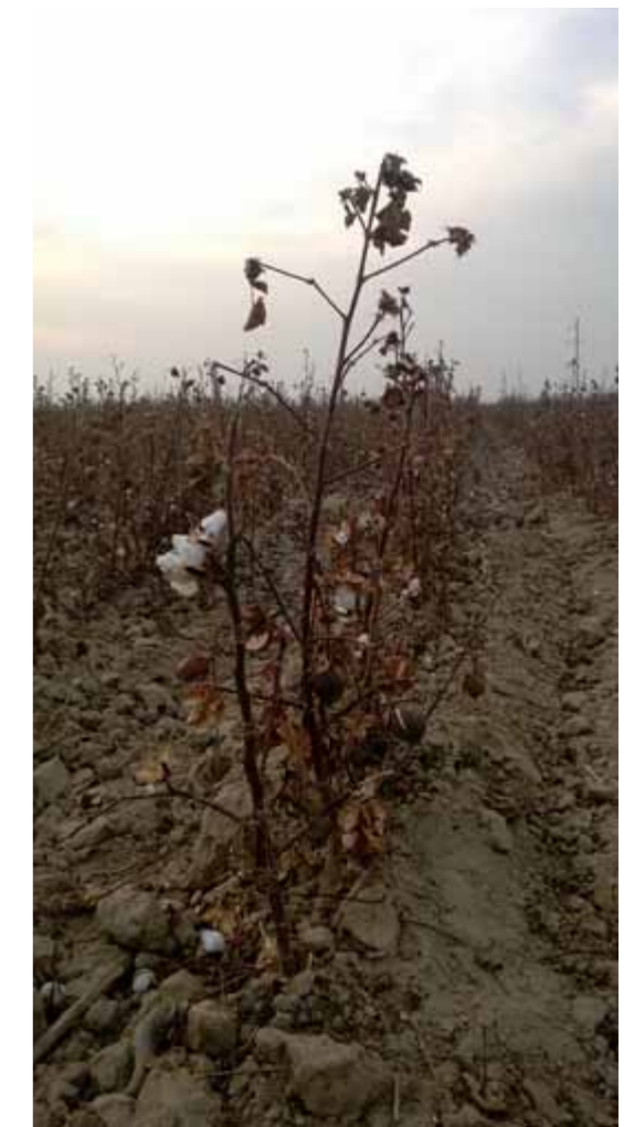
COTTON FIELD AT THE END OF THE SEASON. UZBEKISTAN.