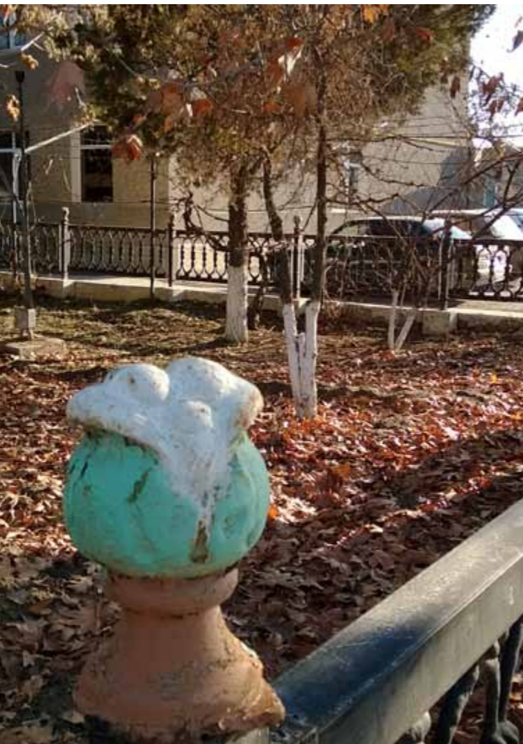
FENCE DECORATION WITH COTTON FLOWERS. SOUTHERN KAZAKHSTAN.