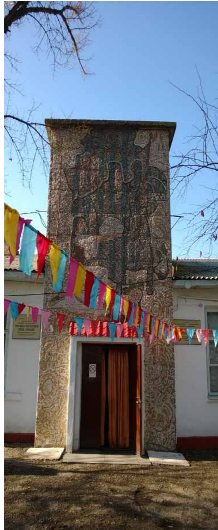
MUSEUM OF COTTON HISTORY. SOUTHERN KAZAKHSTAN.

Last but not least, in case the farmer considers exiting the cotton economy, the tax office will audit the farmer, often finding missing payments of many of the fees listed above. This usually results in the accrual of additional debts to many state organisations (e.g. different kind of state taxes, etc). In case she/he cannot pay it (and this is usually the case), the farmer can be sent to prison. This is probably the main reason why many farmers decide to stay farmers despite its poor financial outlook and the other problems outlined in this study. This also explains why Uzbekistan's cotton economy has a large informal dimension. The numbers presented in the cost-benefit analysis above – while valid – therefore do not uncover the full complexity of Uzbekistan's state procurement system, but are nominally suggestive of the intricate pattern of formalities and informalities that often contradict a more efficiency-oriented functional differentiation.