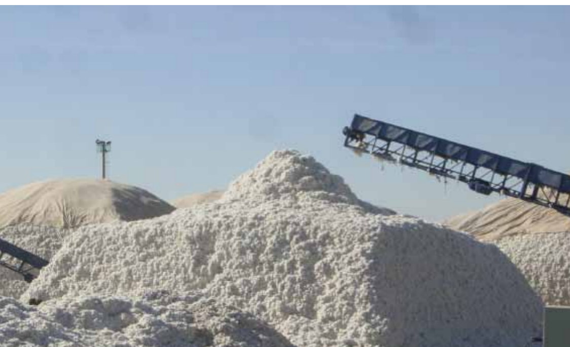
COTTON COLLECTION AFTER HARVEST. UZBEKISTAN.

In Uzbekistan farmers receive land to grow crops under the state procurement system, which is limited to cotton and wheat. Land