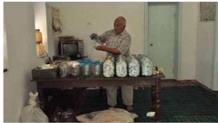
WORKING WITH COTTON IN A BIO-LABORATORY. UZBEKISTAN.

amount of subsidised loans allocated to farmers to grow cotton and wheat and the price at which the crops will be purchased. Subsidised loans are distributed (from the special state procurement system fund) via the central bank to each region by the Ministry of Finance. The money arrives at the district commercial banks and is used by farmers to pay for services and inputs needed to fulfil the state order for cotton and wheat. The commercial banks allocate money to farmers and control how the state subsidised loans are used by farmers.