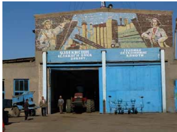
A MACHINE TRACTOR PARK. UZBEKISTAN.

Through the years since independence, the allocation of funds to different service providers involved in the state procurement system has changed as well, with three categories of agricultural service providers emerging in post-Soviet Uzbekistan (Shtaltovna 2012). The first category is state-affiliated service providers . The Uzbek government maintains control and monopoly power over the industries producing fertilisers, oil and gas products, and cotton. The agricultural services provided by the corresponding organisations are therefore oriented toward fulfilling state mandates. Of particular relevance in this case are the Fertiliser Company, fuel supply (Neftebasa), cotton gins, wheat mills and agricultural banks. Organisations of this type are of strong economic interest to the state and remain under state control. In exchange, these organisations receive more economic state indulgences (i.e. more state attention and financial support) but are also inevitably more bureaucratic and overstaffed than the other two categories of service organisations. The second category is the state-ignored service providers . Private bio-labs, commodity produce exchanges, western input suppliers (e.g. Ifoda), veterinary services, insurance, and other private services for animal husbandry and horticulture belong to