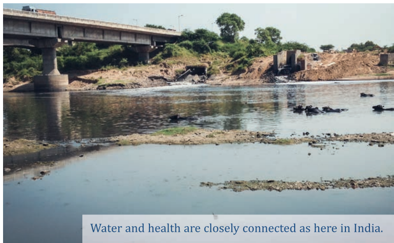
Water and health are closely connected as here in India.

The Graduate School was launched in July 2016 and will investigate the various dimensions and transformations of the urban systems and their impact on human, animal and environmental health. The historical development and current challenges facing North-Rhine Westphalia – in particular the Ruhrmetropolis – will be contrasted with those of three urban metropolitan areas in other countries: São Paulo (Brazil), Accra (Ghana) and Ahmedabad (India). The ZEF-led Graduate School is building on ZEF's established collaborations in the research regions, partnering with the University of São Paulo (USP), the