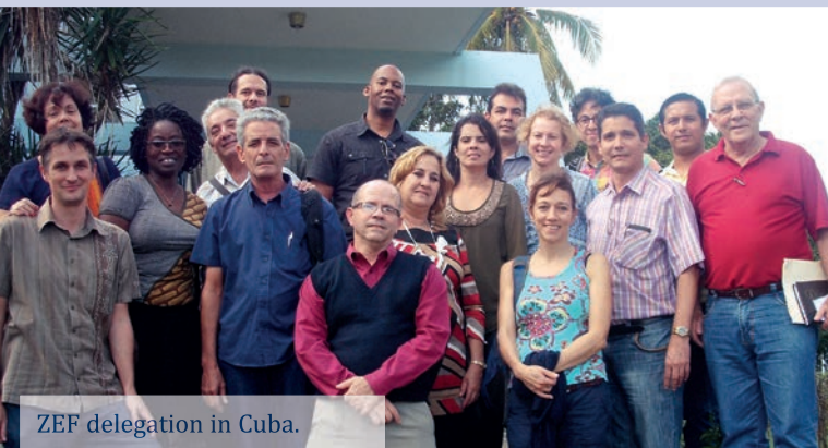
ZEF delegation in Cuba.