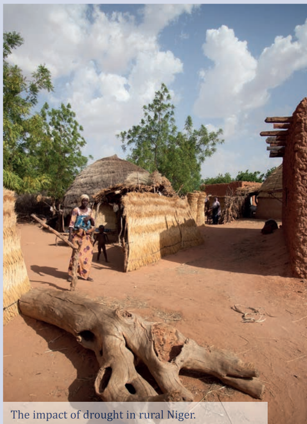
The impact of drought in rural Niger.