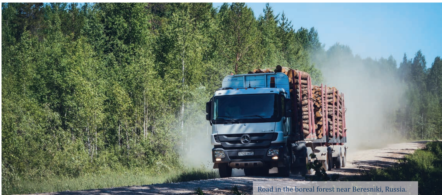
Road in the boreal forest near Beresniki, Russia.

Roads have made it possible for humans to access almost every region in the world. In developing countries in particular, infrastructure development is often perceived as crucial to fostering economic development. But this comes at a very high cost to the planet's natural world. Roads severely reduce the ability of ecosystems to function effectively and to provide us with vital services for our survival. Furthermore, large tracts of valuable roadless areas remain unprotected and the United Nations' sustainability and conservation agenda fails to recognize the relevance of roadless areas.