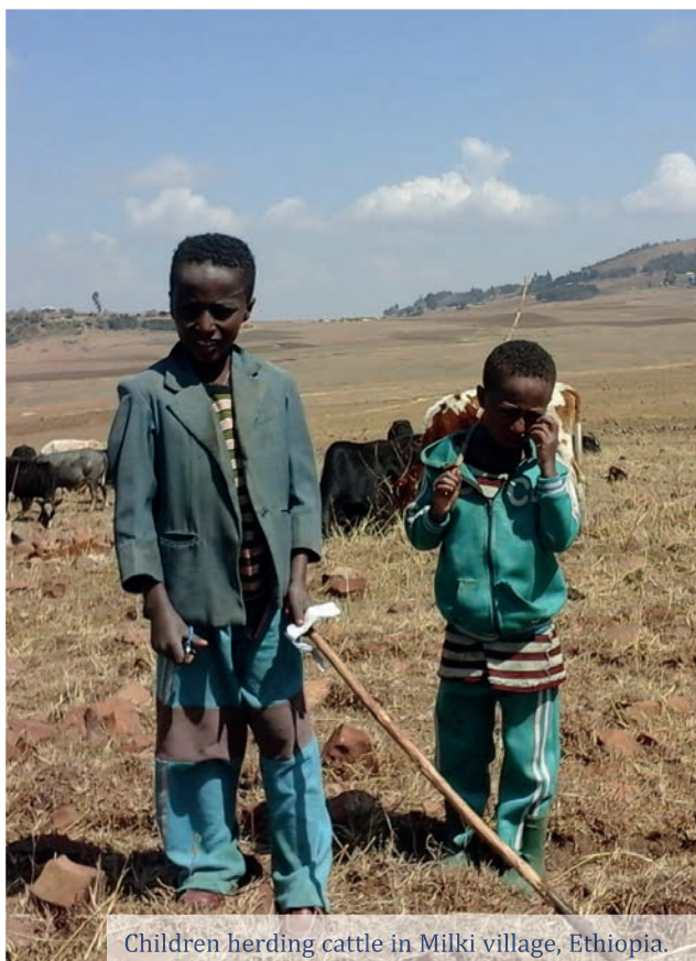
Children herding cattle in Milki village, Ethiopia.

Child labor and its dimensions are a major long-standing global development issue and one of the main areas of empirical investigations in Economics. Child labor related to poverty remains a critical issue and continues to be debated. Various studies argue that child labor may jeopardize the physical development, health, and human capital formation of the child laborers. This may lead to the cycle of poverty and precarious employment conditions later in life. Other studies claim, on the contrary, that child labor might bring more resources to the family and thus improve child nutrition and schooling.