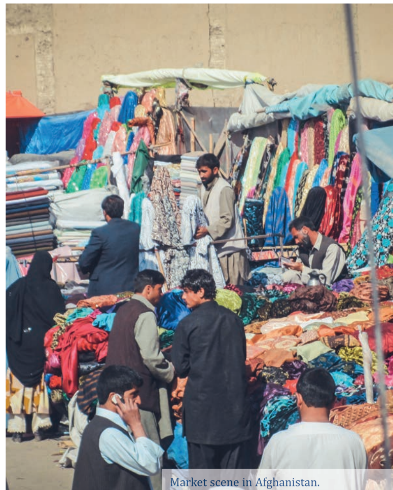
Market scene in Afghanistan.

ment because it caused regressive structural changes at the micro level. It reduced employment opportunities and increased self-employment in activities that have low returns. That is, given a U-shaped relationship between the share of entrepreneurial activities and economic development, the conflict rewinds the process of structural change. Self-employment in activities that are less affected by conflict should be stimulated in order to improve the economic resilience.