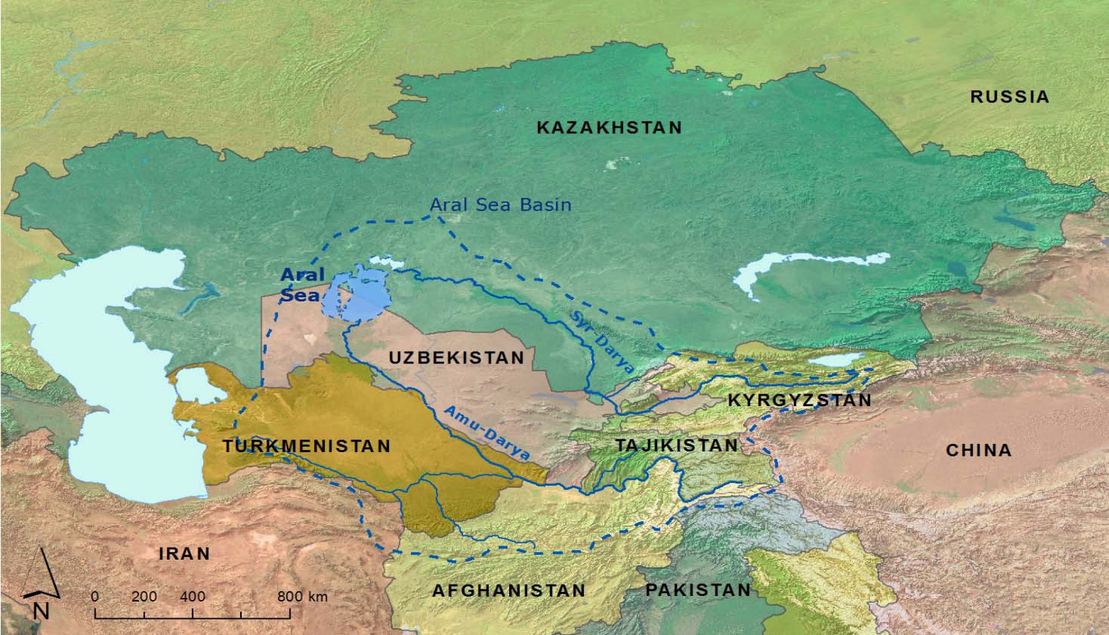
Figure 1. The Central Asian region and the Aral Sea basin