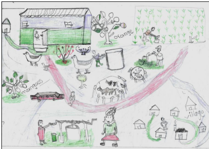
Figure 1: “Future Farm” by Taomga (15)

Interestingly, most of the students participating in the drawing exercises had a clear understanding of how they aimed to attain their future farm . In most cases, this pathway started with the diversification of farm production during the first years. This included growing additional cash crops besides maize (such as sunflowers and cotton) and at a later stage also vegetables and fruits. After some years, they would buy some animals (first small animals such as chickens; then larger animals such as goats and later also cows) and equipment for using animal draught power for land preparation, weeding and transportation. The time component of aspiration and the pathways to the future farm can best be illustrated not by statements but by drawings (see Figures 2 and 3).