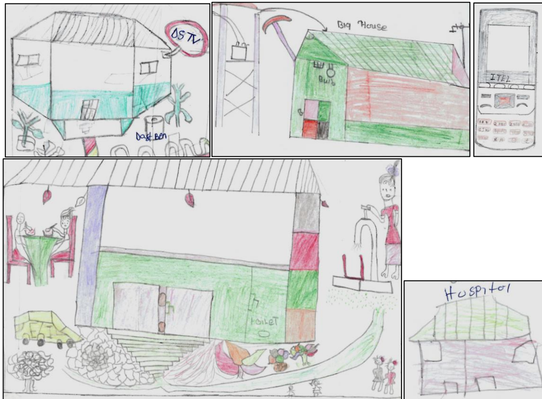
Figures 7-11: City Life from Harrson (16), Raimond (15), Mysterious (17), Margret (16), Vincent (15)

In this context, a considerable number of the respondents had rather naïve perceptions about life in urban areas and romanticised some of its features. For example, there was a strong and common perception that people do not have to work in towns but can still enjoy the amenities of urban areas as reflected by the following quotes: