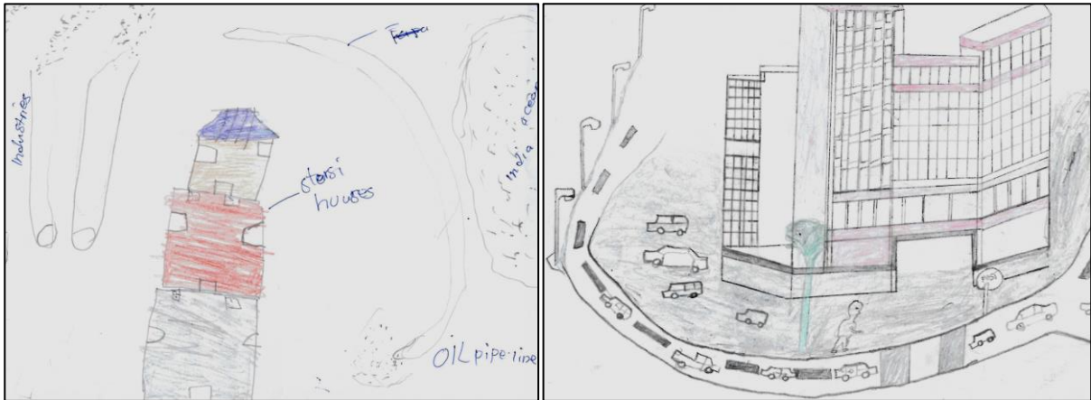
Figures 12-13: Foreign Life from Vincent (15) and Reuben (16)

These examples show that young people do not automatically perceive foreign countries as more attractive, as often suggested. In contrast, for many, these countries were associated with hardship and a lack of security. Thus, regardless of their views on their own countries and rural life, many respondents prefer to stay where they are. This is depicted by the following quote: