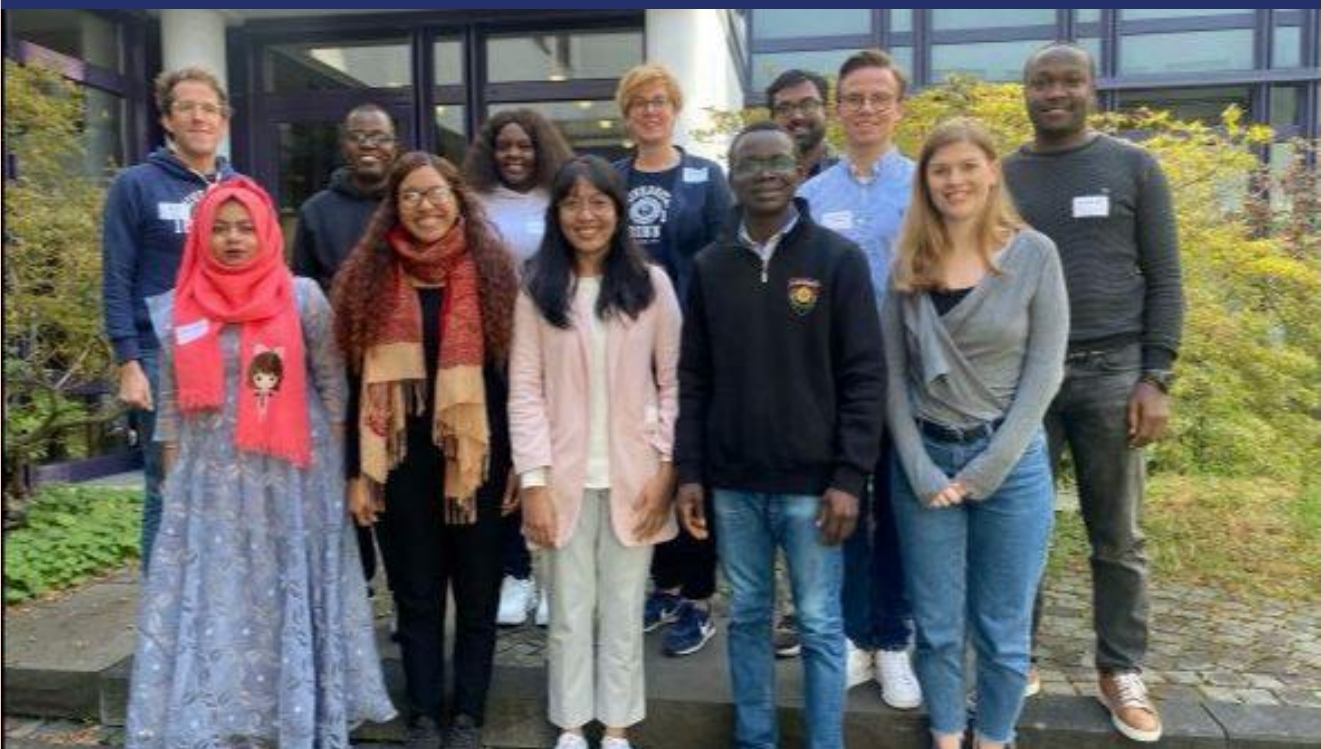
Photo: ZEF's BIGS-DR batch 2022. Click on the photo for more info.