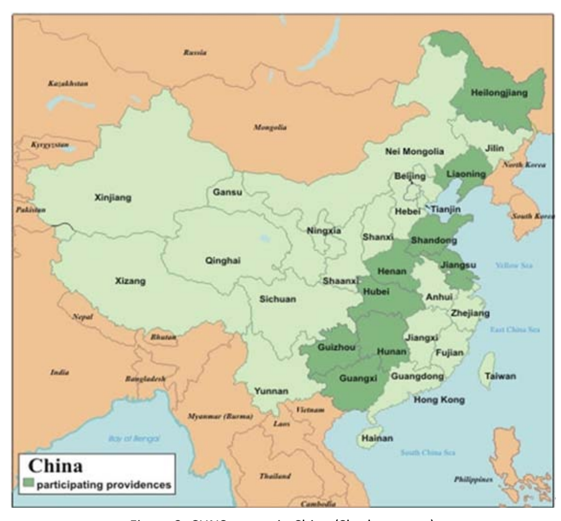
Figure 2: CHNS survey in China (Shadow areas)